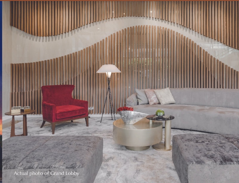
Actual photo of Grand Lobby