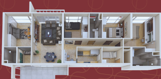
Platinum Unit D 3-BR Unit