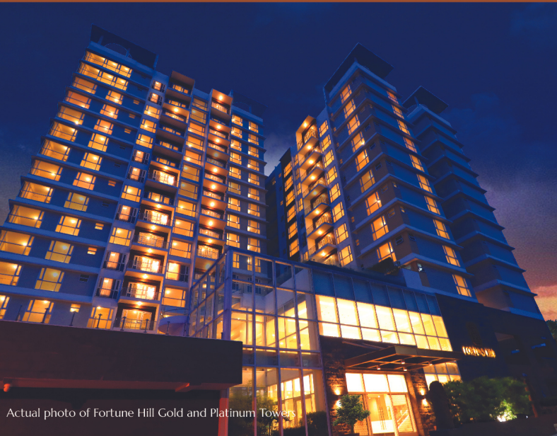
Actual photo of Fortune Hill Gold and Platinum Towers

Fortune Hill is an upscale residential property that offers an elegant city living experience at the heart of San Juan. This midrise condominium, thoughtfully crafted by Prestige by Filinvest, channels a balanced life of luxury for its residents with its strategically auspicious address where prosperity flows in smooth harmony.