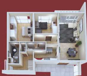
Platinum Unit C 2-BR Unit

*Typical size is inclusive of foyer, ledge, and balcony